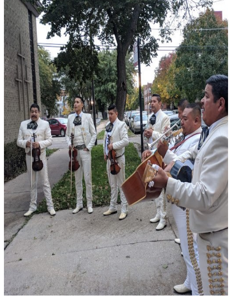
Mariachi Juvenil Tamazula led the Encuentro's Service of Holy Communion—la Misa Panamericana.

Encuentro provides a distinctive opportunity for inter-Lutheran consideration of our Lord's Great Commission as it applies to the increasingly multicultural context for mission in the United States. Among the participants and presenters were members of the