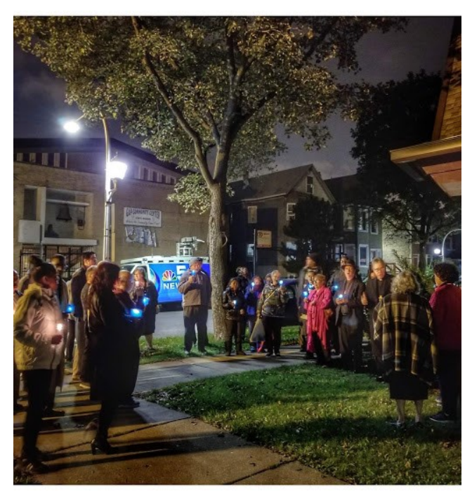
Chicago media outlets covered the Vigil for Peace on Chicago's Streets, held at the conclusion of the October 12, 2018 Encuentro .