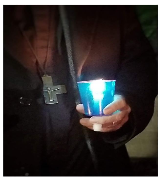
Vigil for Peace, October 12, 2018