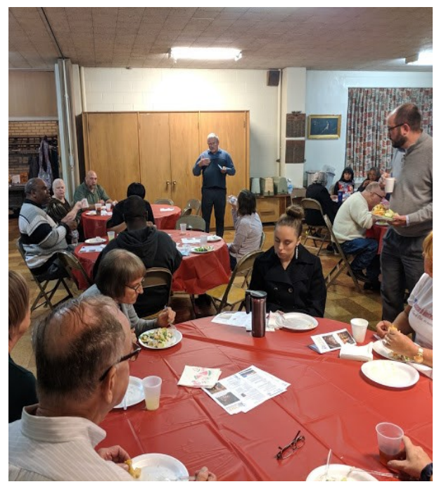
Forty-five church leaders representing more than 12 congregations and denominational ministries took part in the day-long Encuentro conference.