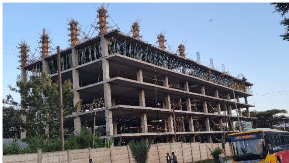
Under Construction. June 2021

Construction of the new building began in April of 2020. All 6 floors have already been erected, the work is actually ahead of schedule. There have been challenges, of course, but the construction quality has been excellent. The emerging building has become a symbol of hope for the seminary and the EECMY in the midst of the global pandemic. It is anticipated that construction will be complete in the spring of 2022.