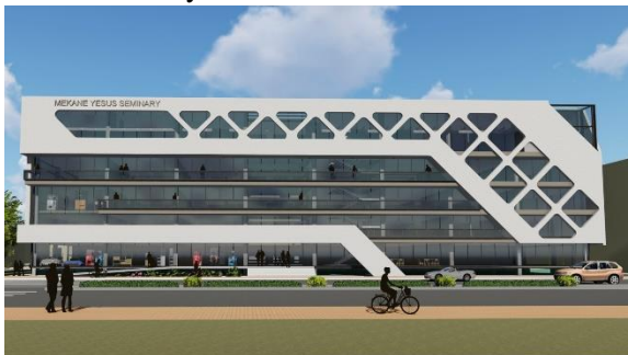
Estimated Completion 2022

All of this has given rise to an exciting venture at the Mekane Yesus Seminary. The Seminary is partnering with Lutheran Bible Translators (LBT) to construct a new building on the campus which will benefit both the work of the seminary and LBT.